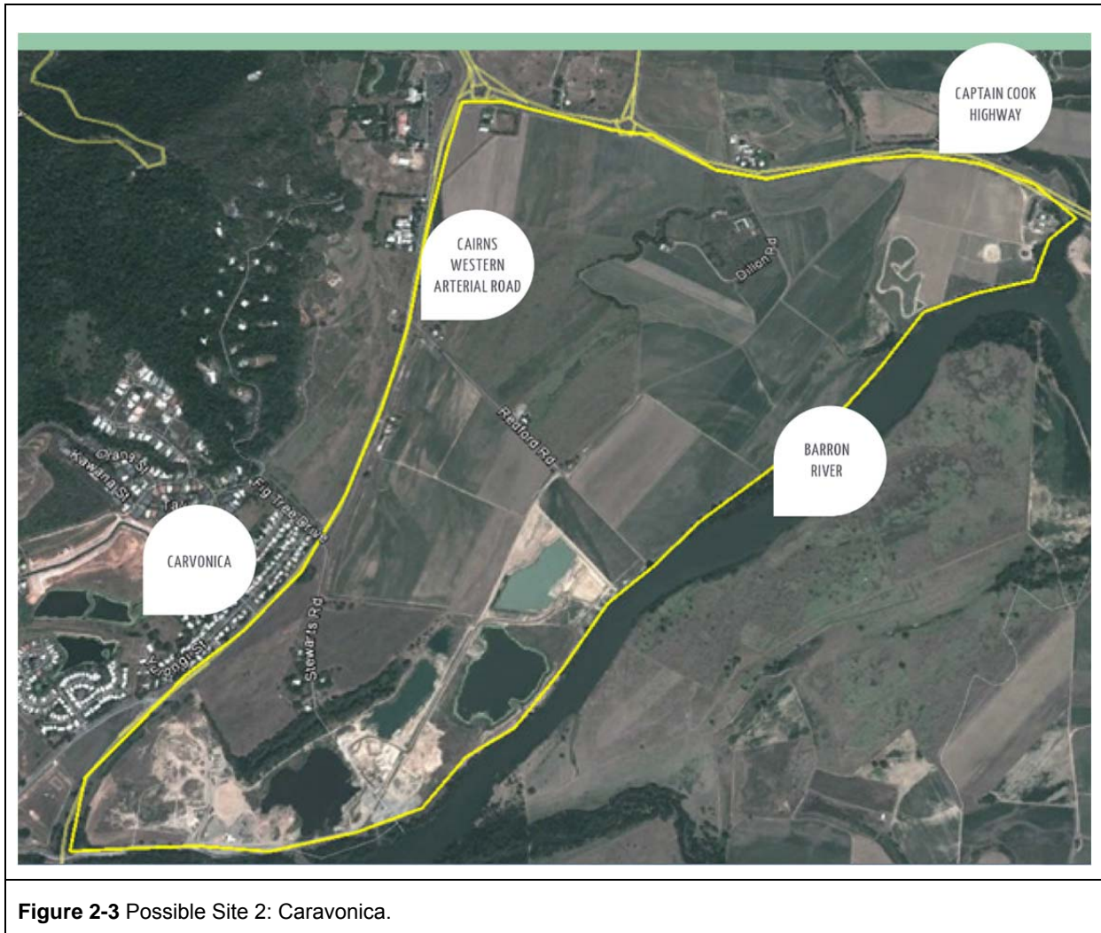
Figure 2-3 Possible Site 2: Caravonica.